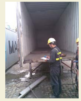
will prepare N.C.R. when found out non-compliance during repair

Since July 2009, our compliance coordinator of container services has cyclically audited every depot and repair workshop to ensure that our repair and quality standards are met, and trained people of repair and quality team how to monitor non-compliance. The manager accountable will be responsible to make corrective actions and follow up until closed.